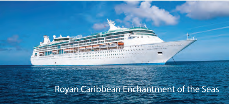
Royan Caribbean Enchantment of the Seas